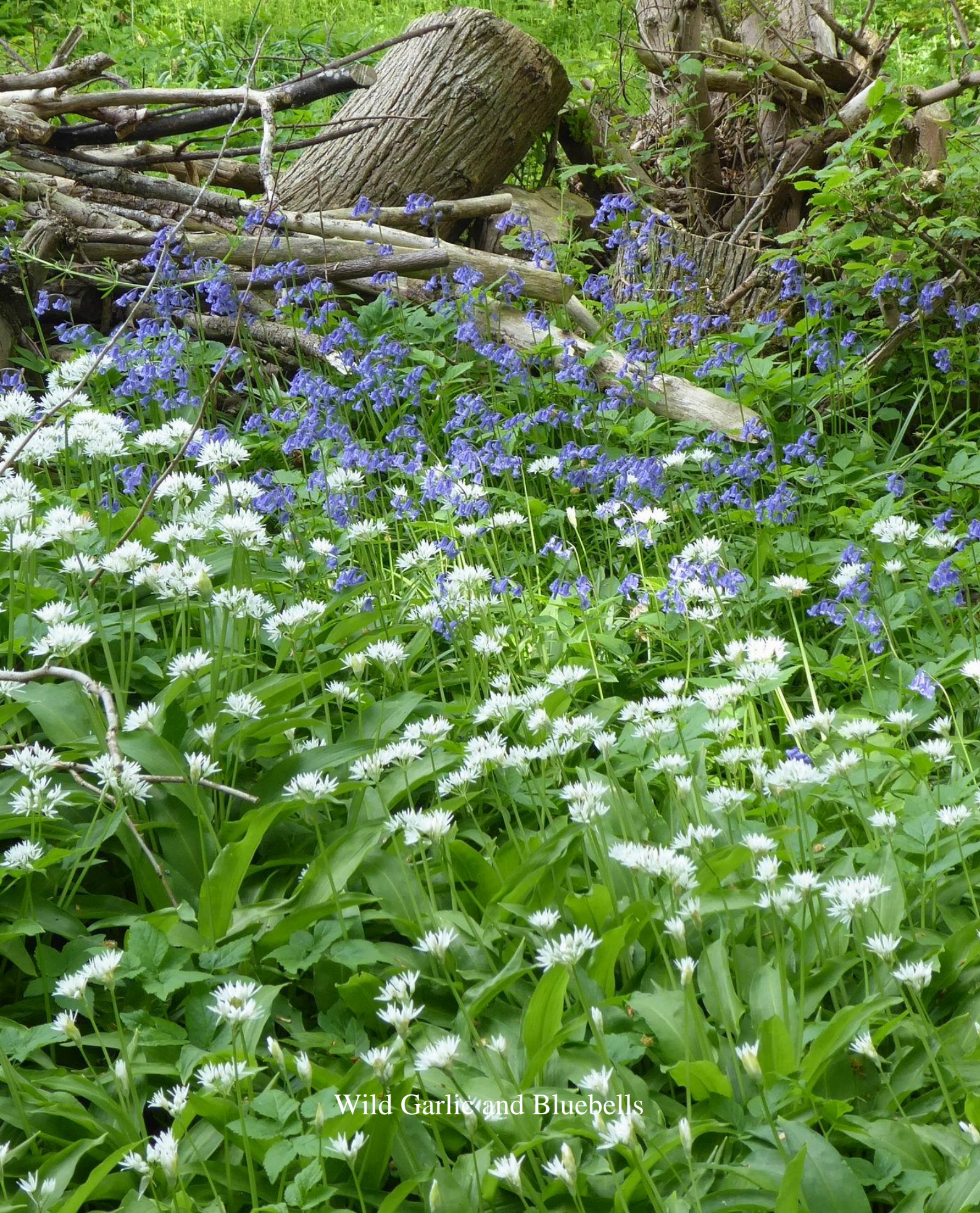
Wild Garlic and Bluebells