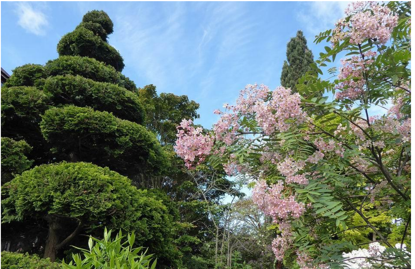
There is interest at every level of the garden from the ground to sky where the pink flowers of Sorbus cashmiriana look down at me.