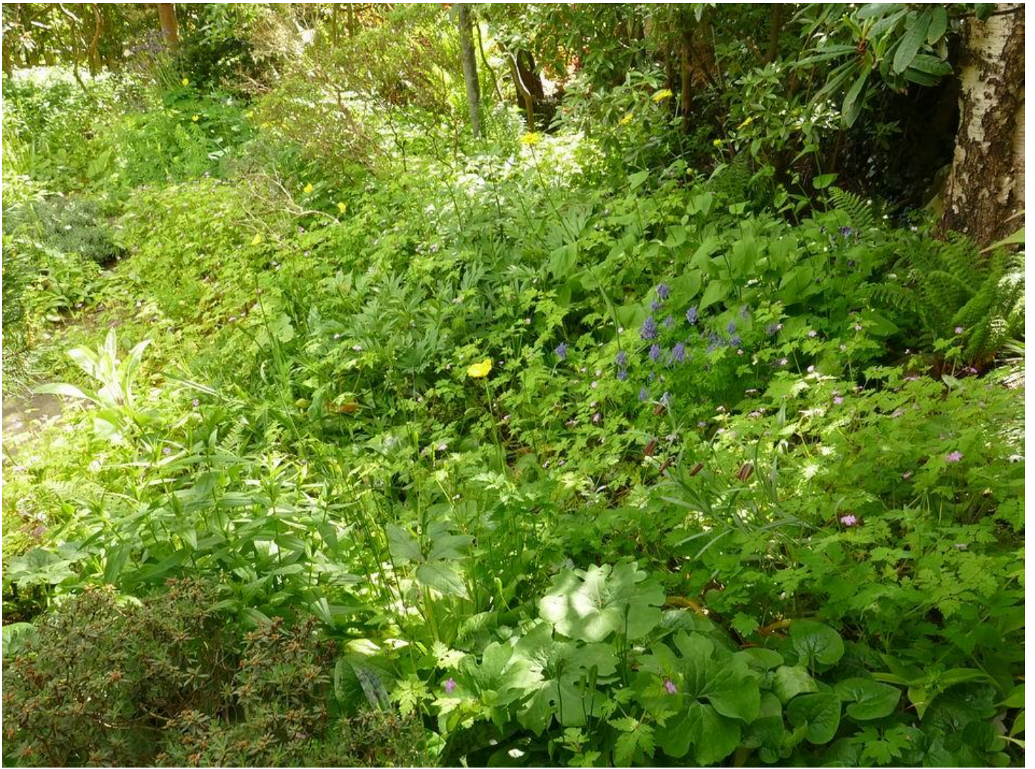
The wild influence prevails in our garden where we adopt nature's dense planting style using a diverse range of plants from across the world.