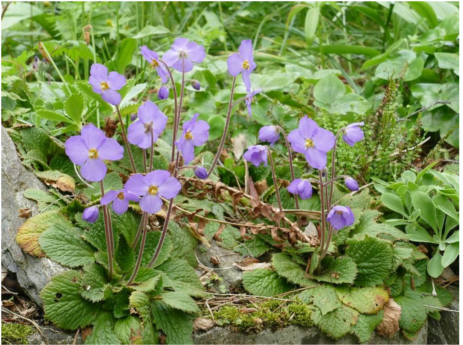
Ramonda nathaliae also thrives in a rocky crevice type habitat.