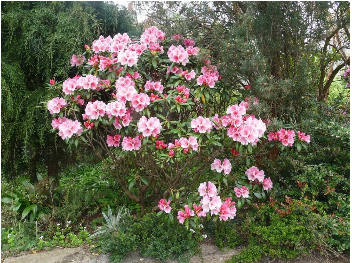
Rhododendron yakushimanum hybrid 'Vintage Rose'