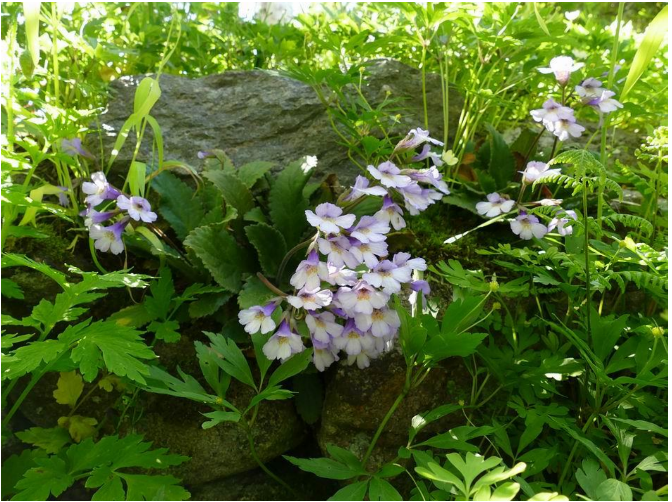
Haberlea rhodopensis grows well in a number of habitats in our garden such as planted between the rocks of a vertical wall and in the shaded side of the rock garden bed below.