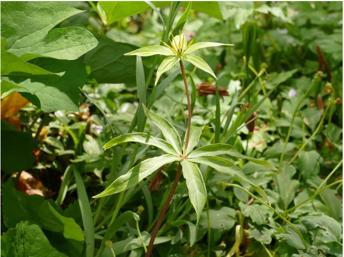
I enjoy walking round the garden finding unusual plants such as this Paris sp.