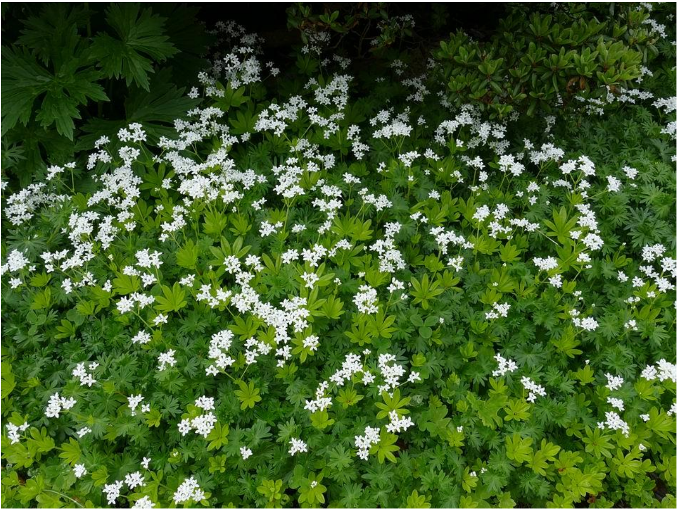
Galium odoratum forms a low growing green carpet studded with white flowers through which other plants grow.