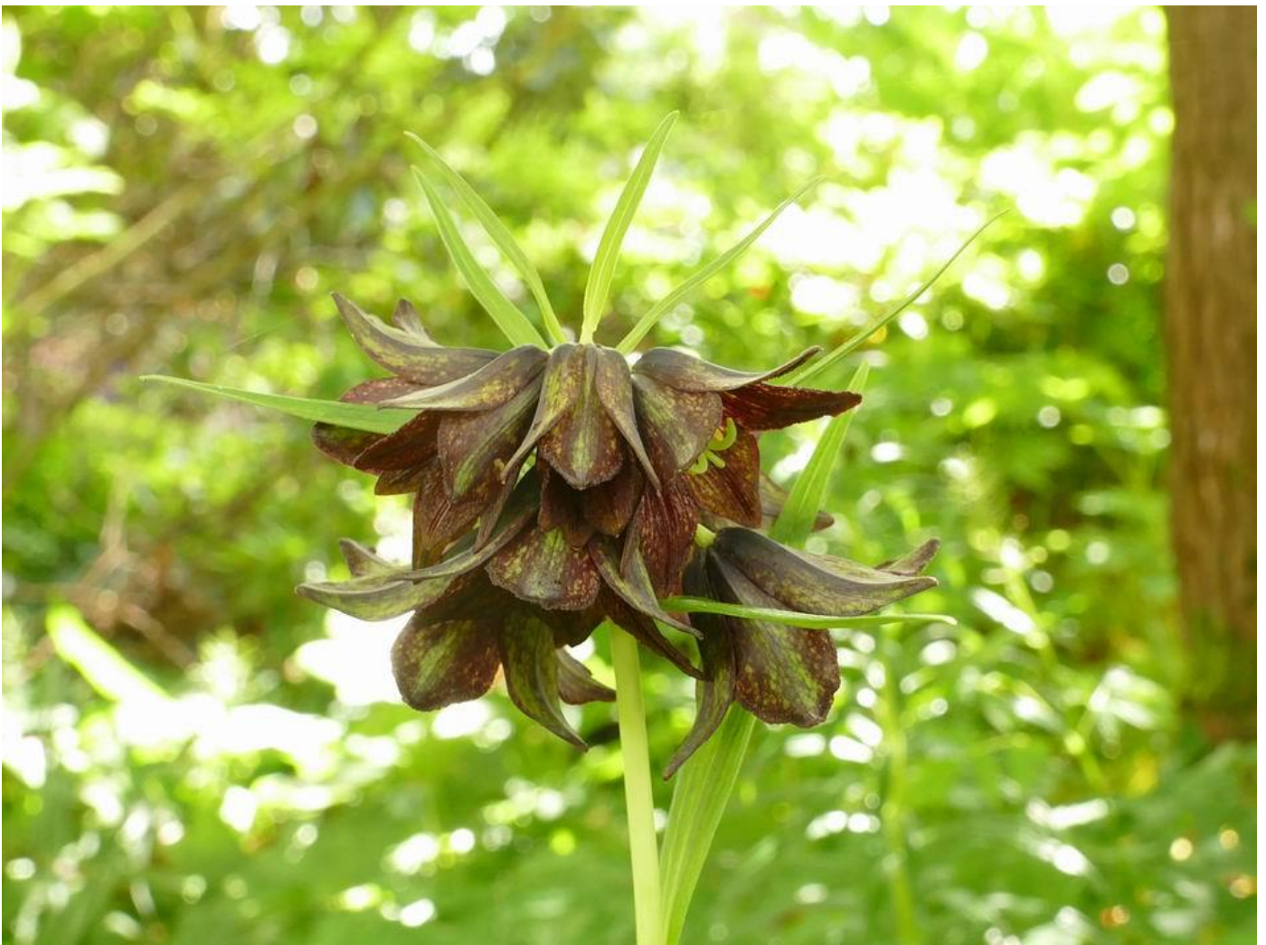
Fritillaria camschatensis Alaskan forms are a slightly different shape and tend to have more green in the flowers.