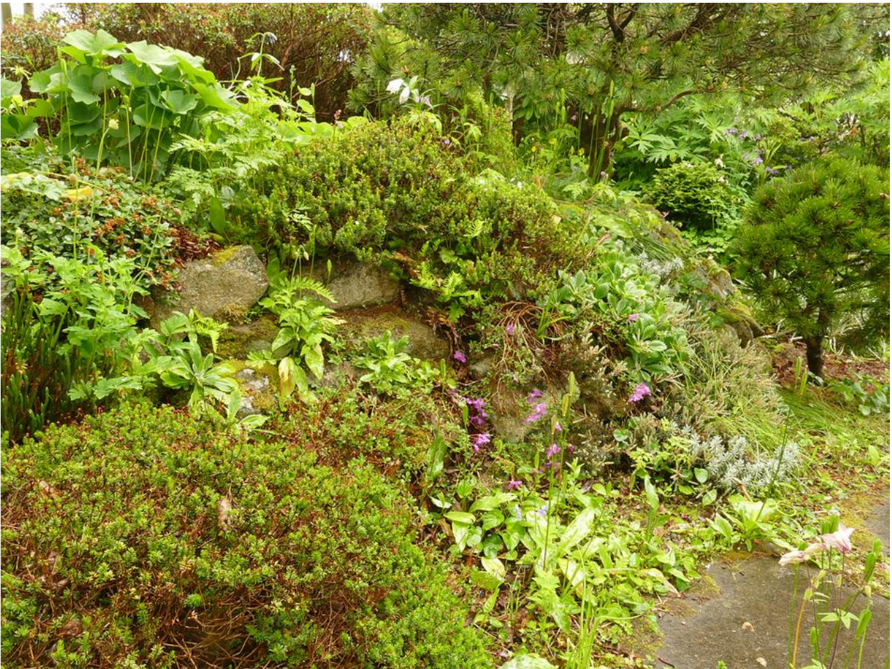
We have created very similar scenes, all be it with a different selection of plants, in our garden complete with the moss covered rocks and ferns.