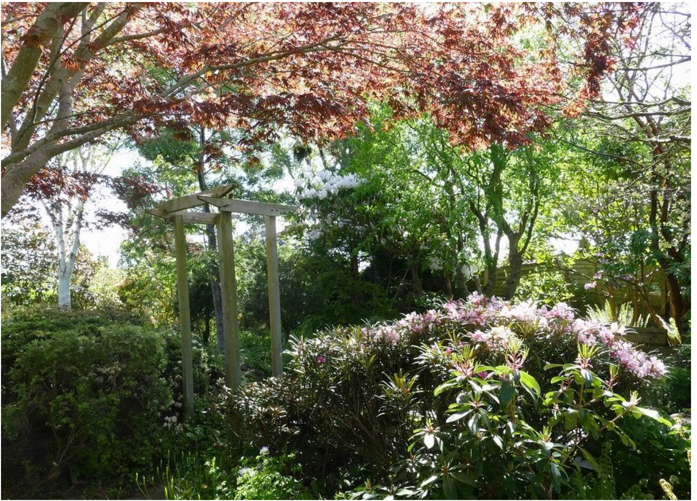
The landscape of the garden is enhanced by trees and shrubs including Acers and Rhododendrons.