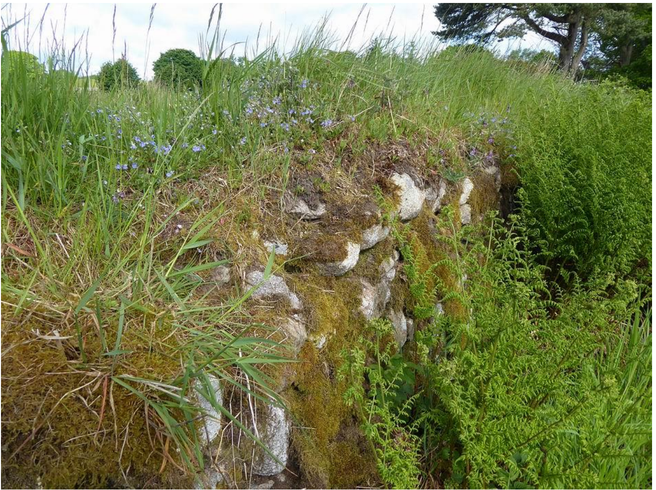
I love the simple beauty of the blue flowered Veronica chamaedrys growing among grasses and other plants on a stone dyke.