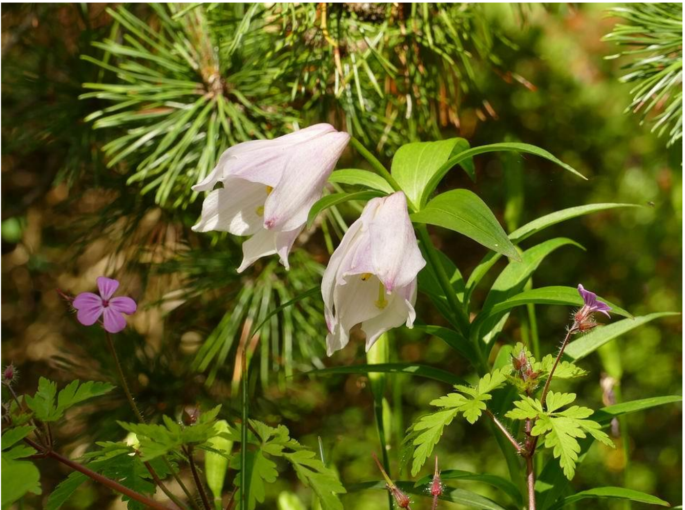
All plants are wild plants somewhere and grow many less common ones such as Lilium mackliniae which rather than being challenged by growing with and through the masses, actually grow better.