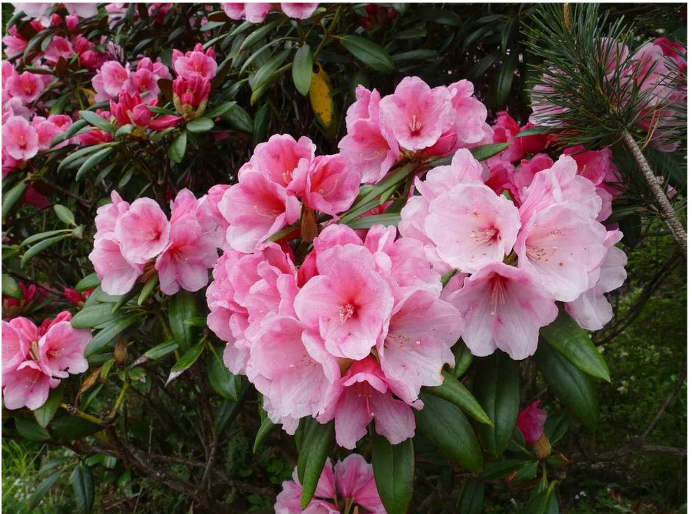
Rhododendron 'Vintage Rose'