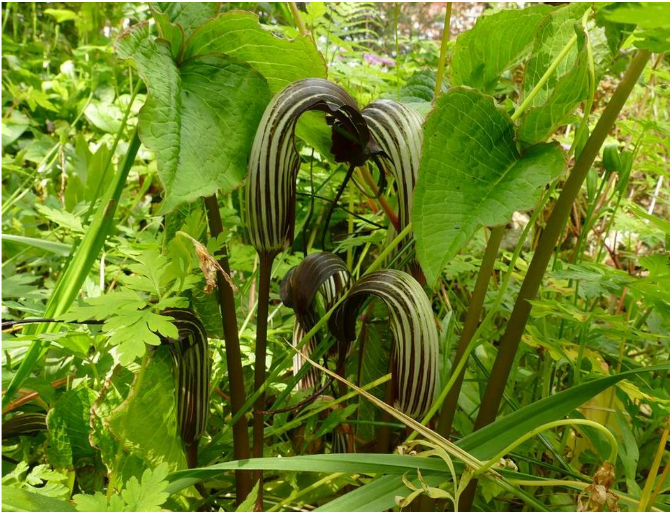
I had not noticed the pointed shoots appearing so it was only this week that I spotted the well advanced growth of Arisaema wilsonii peeking through the dense planting.